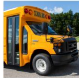
Transit & School Bus