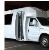
Doors & Lamination