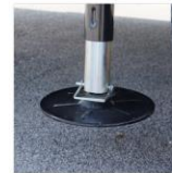
Leveling & Stabilization