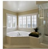
Kitchen and Bath