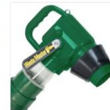
Sewer and Fresh Water