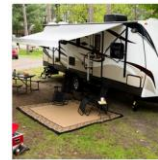
Awnings & Shade Accessories