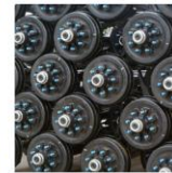
Axles & Suspension